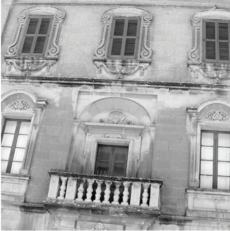
The Maltese Island